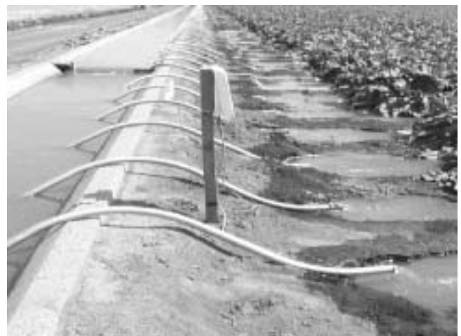
Figure 2. Soil moisture monitor placed at the head of a sugarbeet field.

In addition to the moisture data, soil samples were taken from various depths at the beginning and end of the season to track nitrate movement.